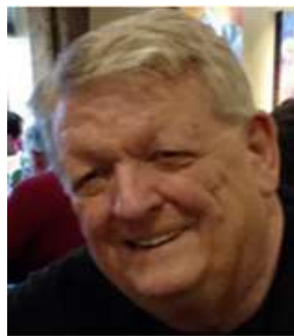
Chuck Line CPI, 2017, JP

After over 40 years of non-option investing, I decided that I needed to include options in my investment strategies. Pacific Investors offers this discipline.