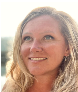
April Borden, 2024, AP

This group feels like opening a book filled with Bruce's life's work, allowing us to absorb decades of experience in a fraction of the time.